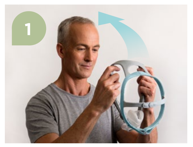
Hold open the bottom straps of the Headgear with the Mask Frame facing downwards.