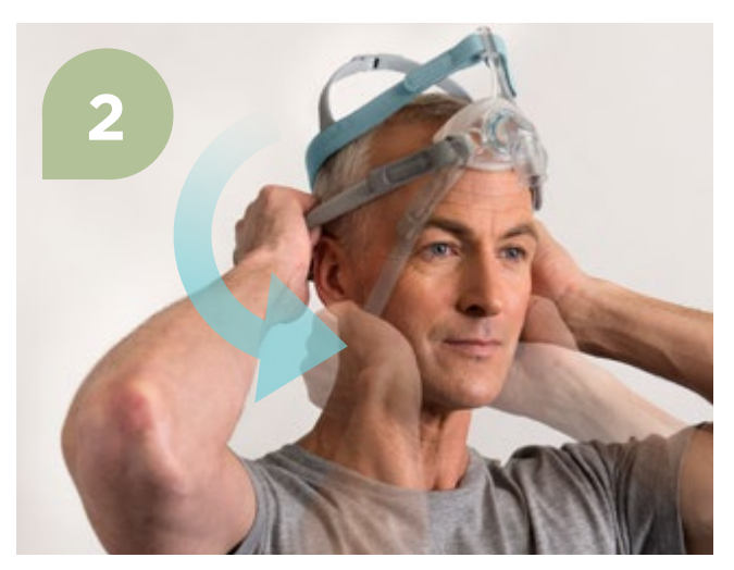
Guide the headgear over your head so that the silicone seal is resting on your forehead.