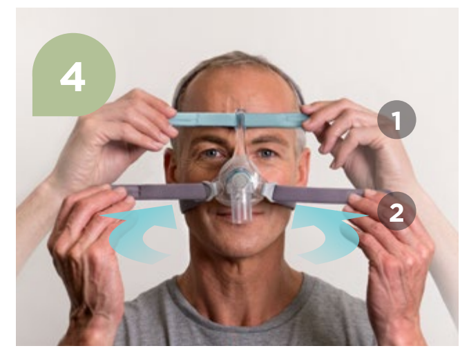
Gently tighten the headgear straps of the mask headgear starting with the blue forehead straps followed by the bottom straps.