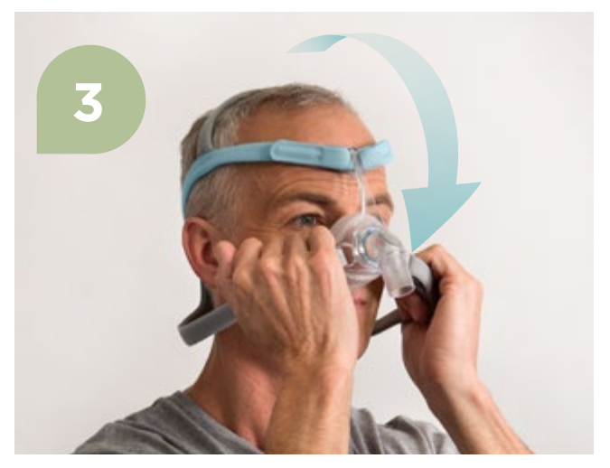
Place your hands on the bottom straps on either side of the mask frame and pull out and downwards. Ensure the silicone seal rests over your nose and the blue top strap is sitting on your forehead.